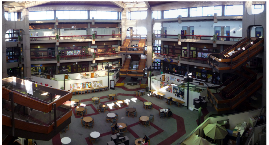
Interior view of the Main Building.